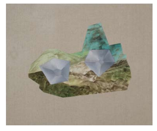
ANDREW RUCKLIDGE, "BITUMINOUS EARTH", 2011, OIL AND ARCHIVAL INK ON TONED GESSOED LINEN 30 X 36 INCHES

2013 RECIPIENT OF THE K.M. HUNTER ARTIST AWARDS, VISUAL ARTS