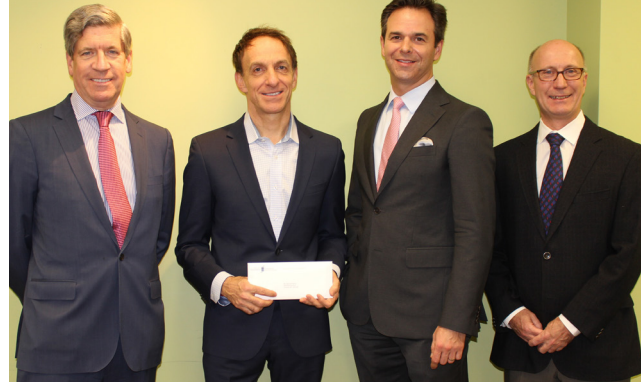
LOUIS APPLEBAUM COMPOSERS AWARD