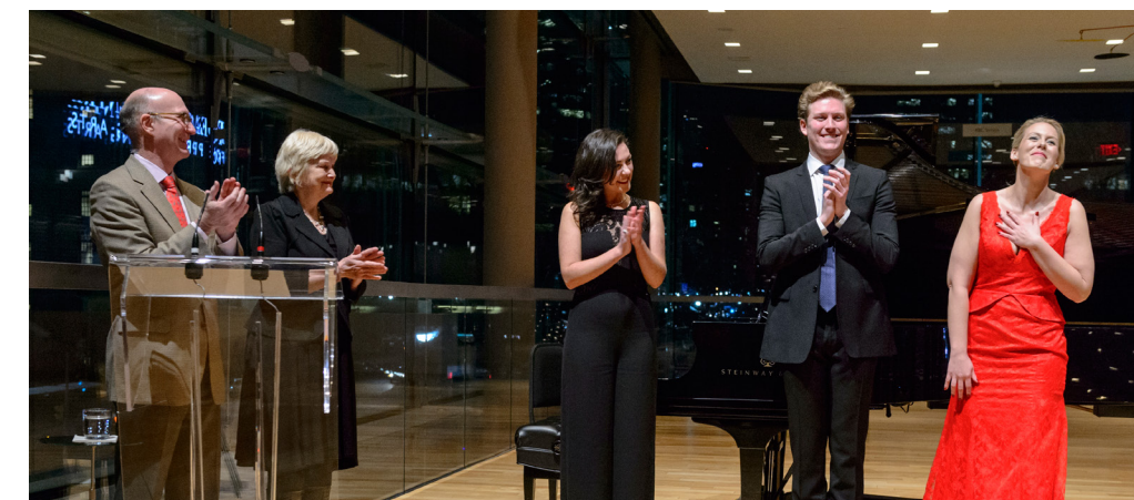
CHRISTINA AND LOUIS QUILICO AWARDS

The arts enlighten us. They entertain us. They enrich our lives. And many of us would like to give something in return.