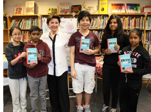
RUTH AND SYLVIA SCHARTZ CHILDREN'S BOOK AWARDS