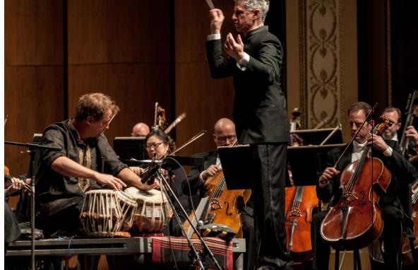
WINDSOR SYMPHONY ORCHESTRA, WINDSOR