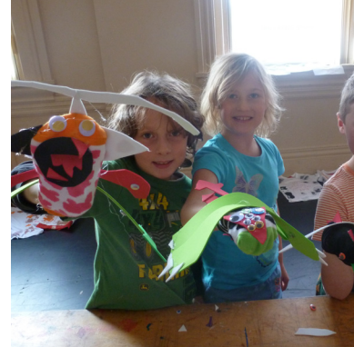
CAROUSEL PLAYERS, ST. CATHARINES