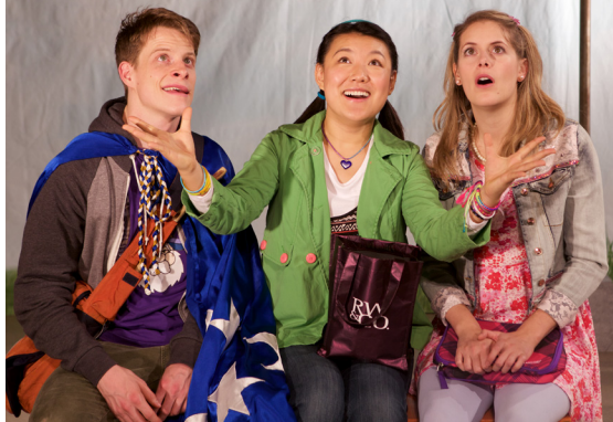
ROSENEATH THEATRE, TORONTO